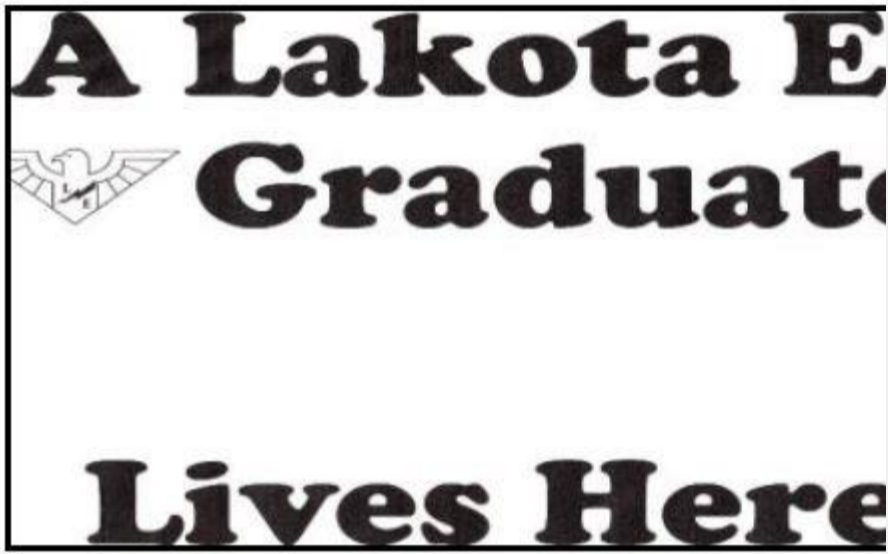
Old Design Signs $10 each while supplies last!