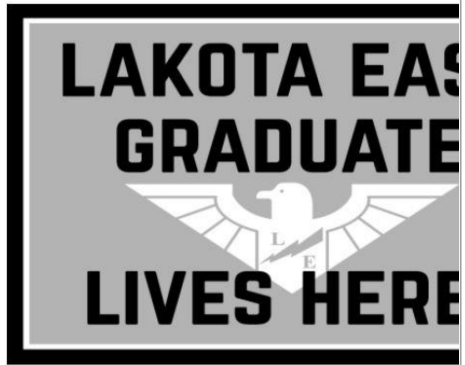
New Design Signs $20 each